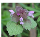
Red dead nettle